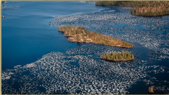
On May 18, the ice had retreated enough for us to get to camp and start the chores.