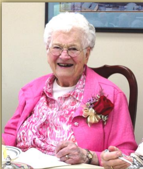
Florence turned 100 on Sept 23, 2014 and enjoyed a big party