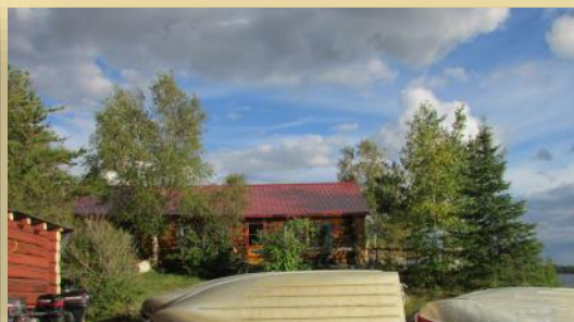
Finally it doesn't rain inside the lodge.