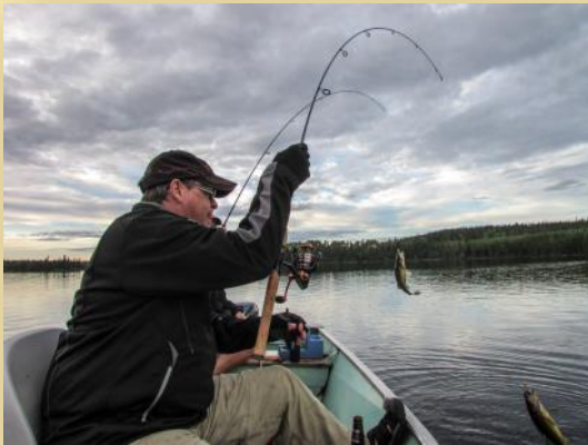
Jugging in the evening is just pure fun. Watching the sunset is the bonus.