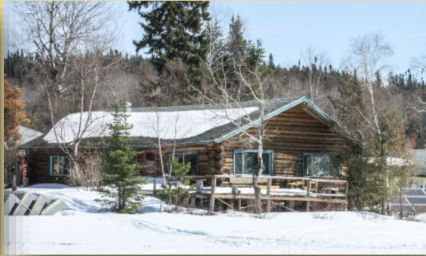
The lodge sits waiting for spring on April 18, 2014.