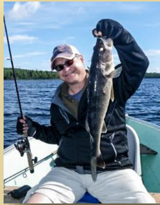
The walleye on the left is a blue walleye with neon blue slime instead of yellow. Enid saw about 6 of these this past summer.